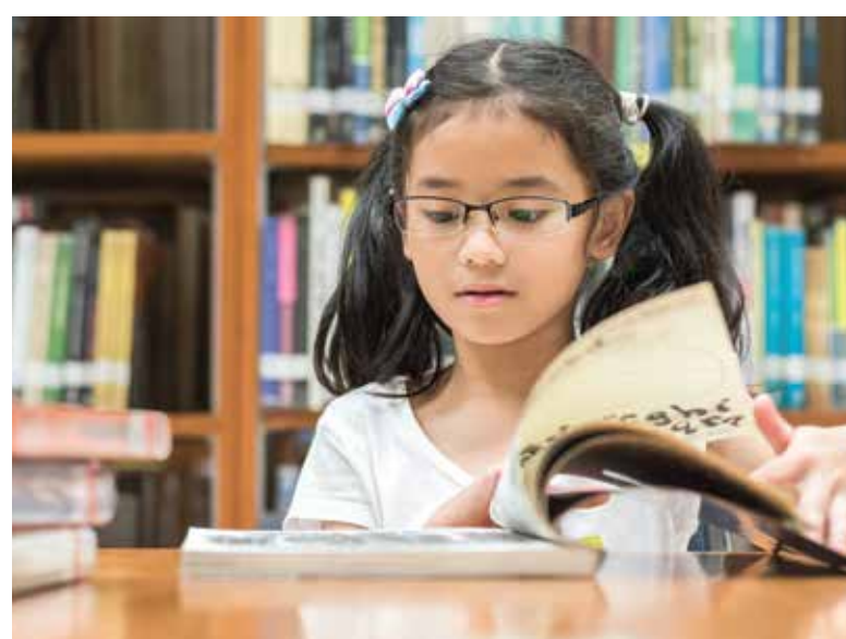
Dripping Springs Elementary School