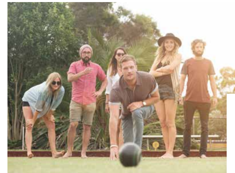
Future Tennis, Pickleball & Bocce Ball